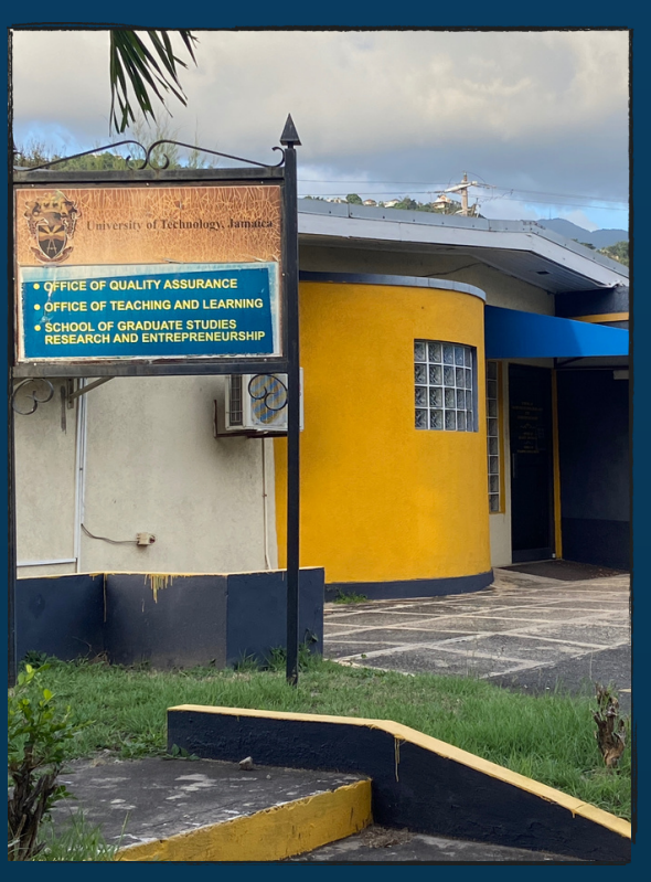
UTech, Ja. Co-operative Education Unit at the Papine Campus

In the 1970s and 1980s respectively, the Science and Engineering departments at UTech, Ja. ventured into a groundbreaking initiative by partnering with industry to provide students with practical, on-the-job experience.