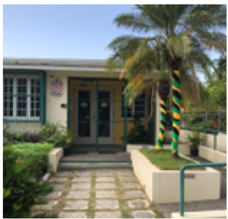
Jamaica Olympics Association Co-operative Education site