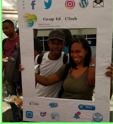
Students taking photographs with the Co-op Ed Selfie Frame