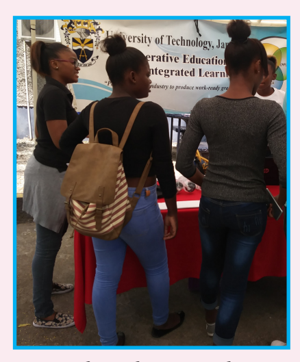
Students learning about Co-op Ed at UTech, Ja.