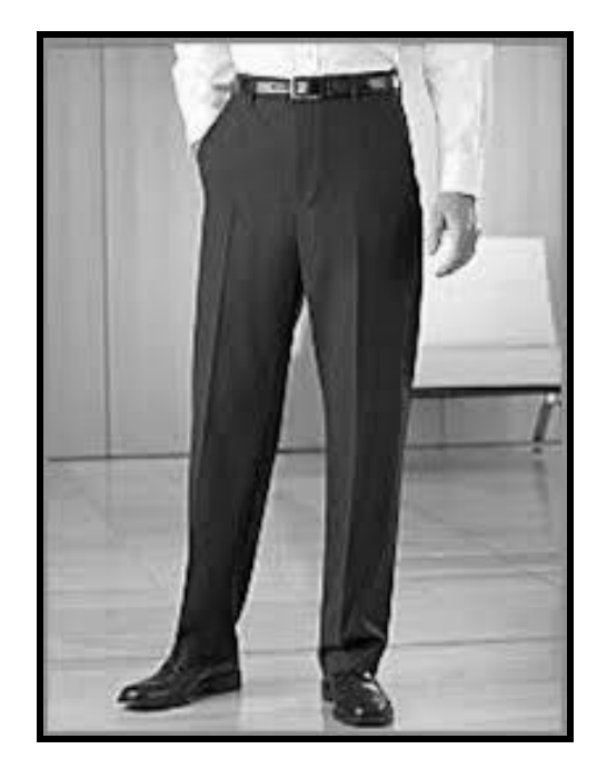
Figure 5: Black dress pants with pleats

NB: Shirt is to be tucked into the waist of the pants and worn with an appropriately sized plain black belt with an unadorned buckle.