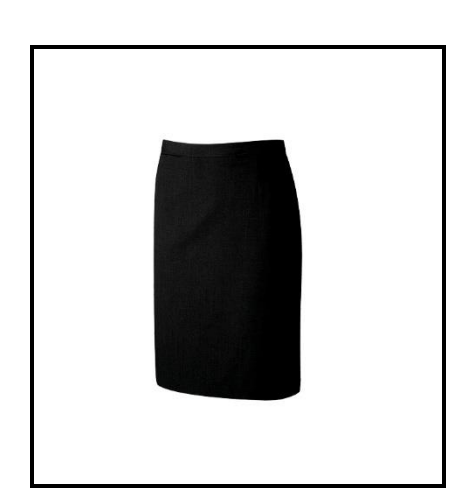
Figure 2: Black A-line skirt