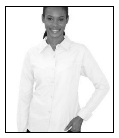
Figure 1: Plain, white, long sleeve, button-front blouse