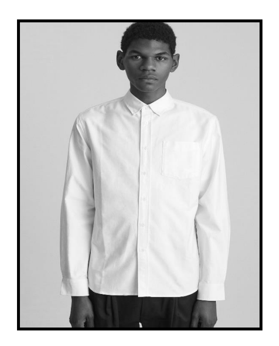
Figure 4: Plain (unadorned), White, long sleeve, button-front shirt,