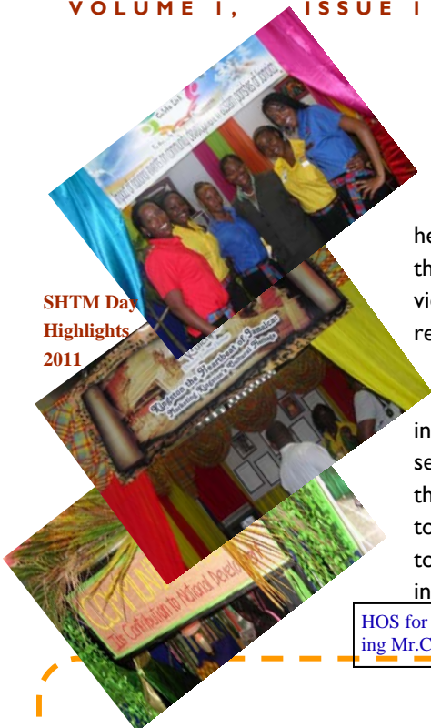
SHTM Day Highlights 2011

Health Tip Sun rays are strongest between 10 am and 4 pm. Stay in the shade and apply sunscreen often to remain protected.