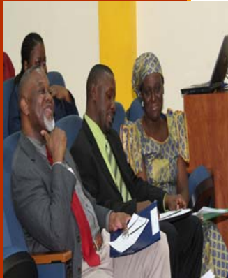
Scenes captured from SOBA panel discussion. On Growth Inducement Strategy put on for the first time by the Econ Dept