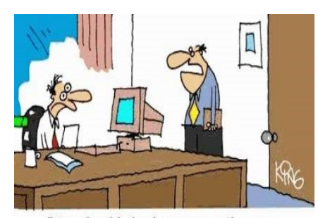
"You should check your e-mails more often. I fired you over three weeks ago."