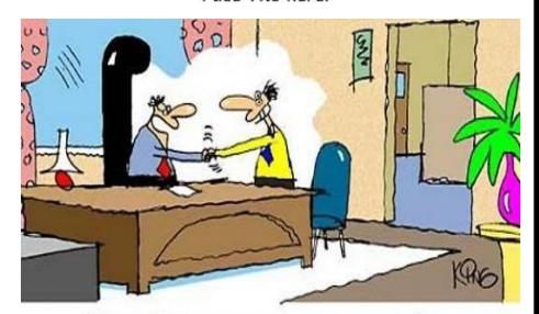
"Everything on your resume was lie. I like that. Welcome to sales!"