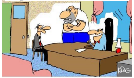
"Before I show you where you'll be working, let me just say that some companies use money as an incentive... I use Vito here."